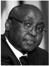
Dr. Donald Kaberuka President of the African Development Bank. Former minister of finance of Rwanda.